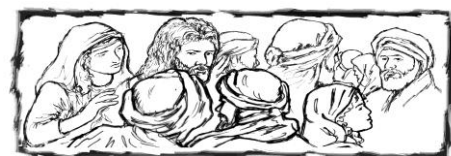
Jesus heals a sick woman